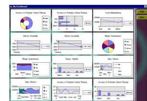
Balanced Scorecard Derived My Scoreboard on Q9™