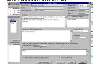
Internal Audit Report