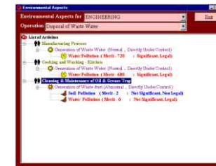
Environmental Aspect Identification and Assessment on Q9™